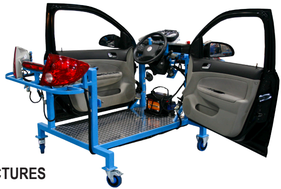
NON CONTRACTUAL PICTURES