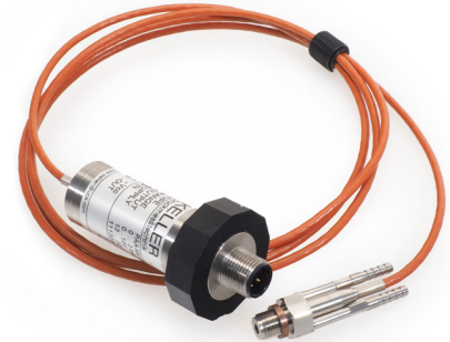
Series M8cool HB