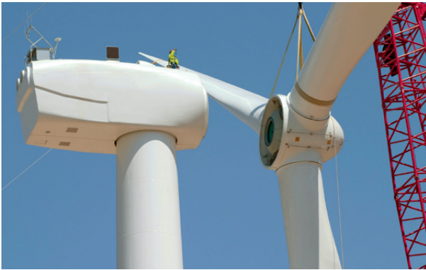
In conjunction with imc CANSASflex, distributed measurements can be carried out quickly and safely.