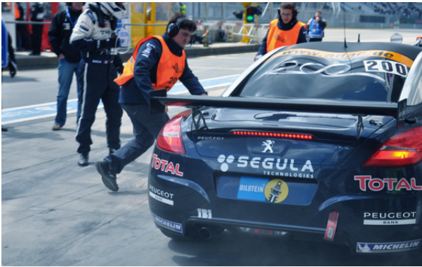
Thanks to its lightweight, compact design, the imc BUSDAQflex is ideal for vehicle testing.

The new data logger is perfectly complemented by the imc CANSASflex series measurement modules. Thanks to the click mechanism, the modules can be directly attached to the logger without tools and cables. In a very short time, a complete measurement system that can synchronously record and store all data can be made from a pure field bus logger.